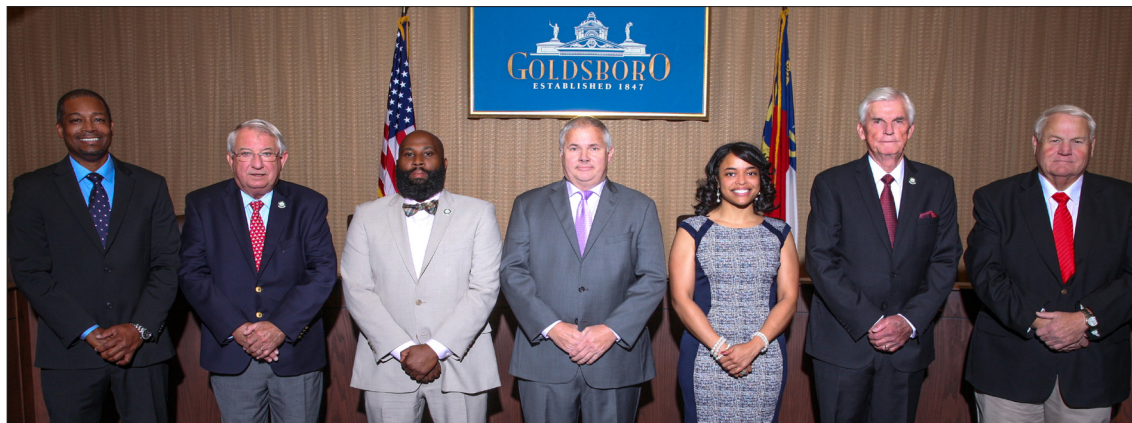
Goldsboro City Council

I hope this newsletter finds all our citizens doing well and staying healthy. As we enter 2021, I would like to reflect a minute on 2020 and mention some of the things that happened in Goldsboro.