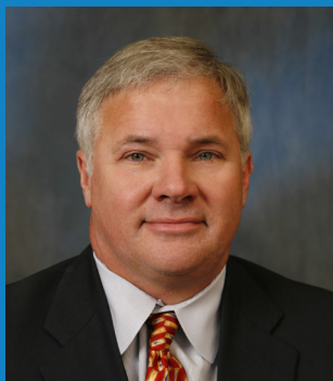
MAYOR CHUCK ALLEN