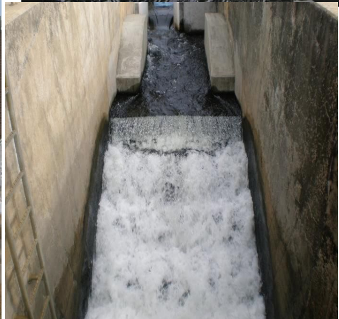
Reclaimed Water and Constructed Wetlands (Outfall 002)