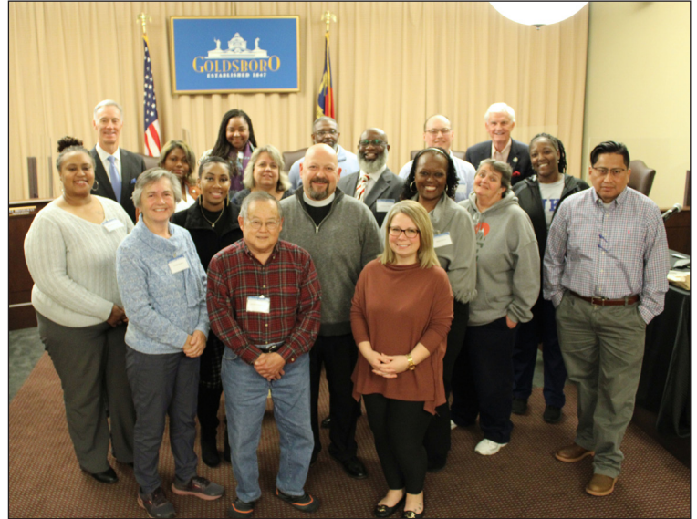
Graduates of the 2022 Citizen's Academy.

The City of Goldsboro is accepting applications for its 2023 Citizen's Academy, which will be held Jan. 12 through March 2, 2023. The application deadline is Monday, Oct. 31.