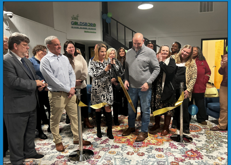
Travel and Tourism moves into new office space: Congratulations to our Travel and Tourism department, who recently moved into a new location at 119-C N. Center St.