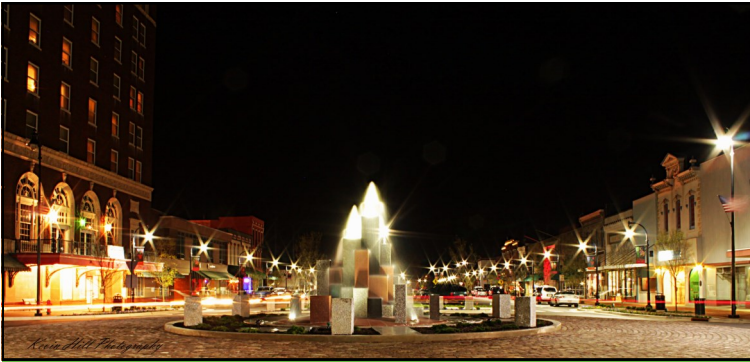
The new Center and Walnut Street Intersection Due to TIGER V and City of Goldsboro Investment.

Project Summary - The TIGER VIII grant application will encompass the continuation and enhancement of projects that were funded with a TIGER V grant that began construction in August 2014 and were completed in October 2015, including: 1) GWTA Transit Center construction, 2) Three Blocks of the Center Street Streetscape Project, 3) Streetscape work to connect Center Street to the Union Station/GWTA Transit Center, and 4) Union Station/GWTA Transit Center site work. There are four distinct, yet interrelated components of the TIGER VIII project. Each are briefly described below.