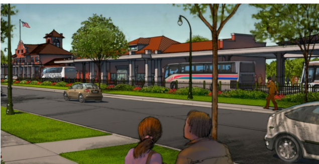
GWTA Transit Center - Concourse