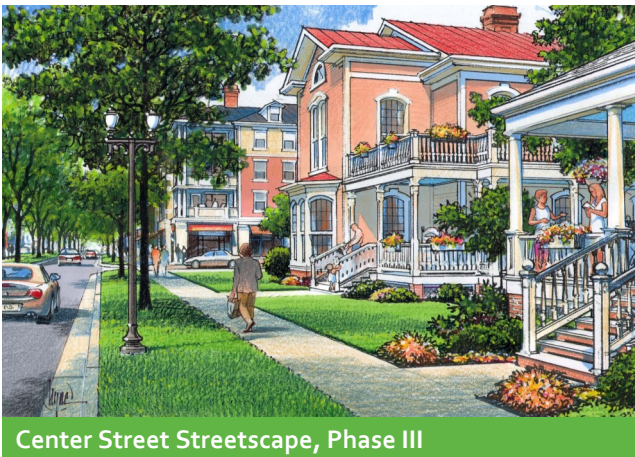
Center Street Streetscape, Phase III