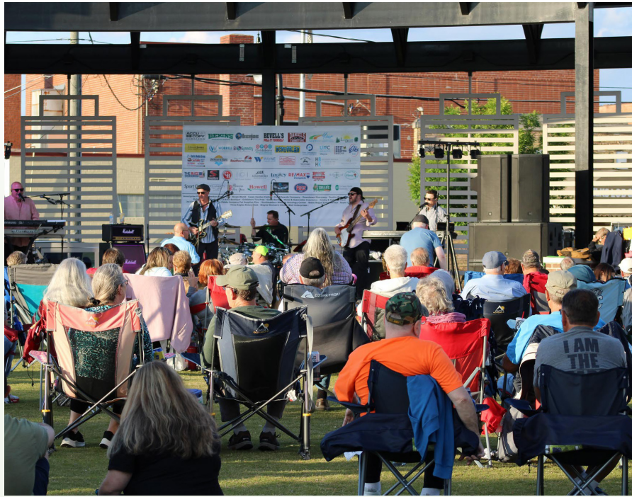
Center Street Jam, a FREE downtown summer concert series, is just one of the City's numerous festivals and events held throughout the year.

The City of Goldsboro is the proud home of Seymour Johnson Air Force Base (middle right photo), home of the 4th Fighter Wing and 916th Air Refueling Wing. Seymour Johnson received the Commander in Chief's Installation Excellence Award from the Air Force for 2001, the highest award given to a military base. Spanning more than five decades and five wars, Seymour Johnson AFB's 4th Fighter Wing is one of the most distinguished fighter units in the world. The 4th Fighter Wing of Seymour Johnson Air Force Base, N.C., puts airpower on target, on time for America. The wing is home to the multi-role, all-weather F-15E Strike Eagle and provides worldwide deployable aircraft and personnel capable of executing combat missions supporting the Aerospace Expeditionary Force.