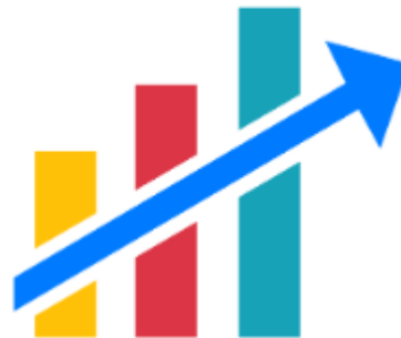
Strong & Diverse Economy