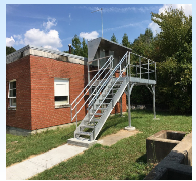
New raised platforms for electrical controls.