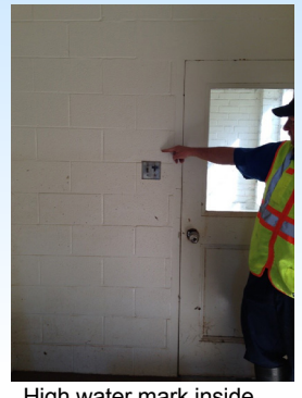
High water mark inside pump station.