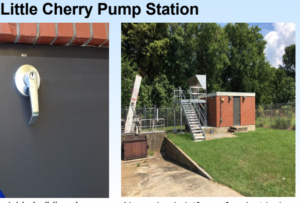
New raised platforms for electrical

Federal and State grant funding is available for community floodproofing or drainage improvements and other types of mitigation projects. The City has been awarded $105,355 for stream clearing and this project is underway along Howell Creek, Stoney Creek, Big Ditch, Mimosa Park, and a tributary leading to the Little River. Per the grant award, all work is to be accomplished by hand and not with heavy equipment, and must be finished by December 2019. In addition, we have applied for $6,000,000 to help with additional stream clearing, shelter improvements, floodproofing our water treatment plant and pump stations, and housing. We will continue to seek outside funds to help our community recover and be better prepared for the next natural disaster.